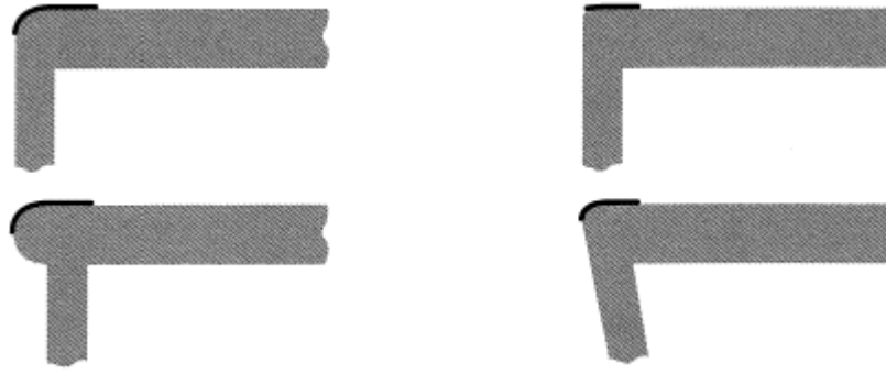
Figure 2 – Positioning of slip resistant nosing should continue to the vertical front face of rounded nosings (Roys & Wright, 2003).

Safety on stairs can be improved by ensuring good lighting, whether by artificial or natural means. Charman (1997, cited in Davies et al, 2001) described how in low light, hazards would be less visible. In addition, the depth of field of vision will be poor because of dilated pupils, making judgement of distance more difficult. The IES handbook recommends a range of 108-125 lux for commercial, institutional, residential and public assembly interiors, and 54-108 lux for industrial settings (Templer, 1992). The illumination across the stairwell should be reasonably constant and shadows on steps should be avoided. The switches that control stair lights should also be positioned such that there is no risk of a person falling while reaching for the switch, three way switches should be used at the bottom and top of stairs (Templer, 1992).